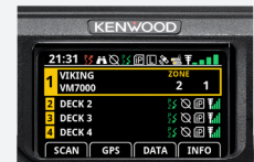
Night - High Contrast