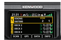
Night - High Contrast